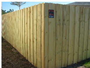
Board on Board

WARNING: Pre-manufactured sections may not comply with this code. Product approval may be required.